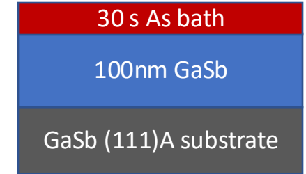
Characteristically rough GaSb (111)A